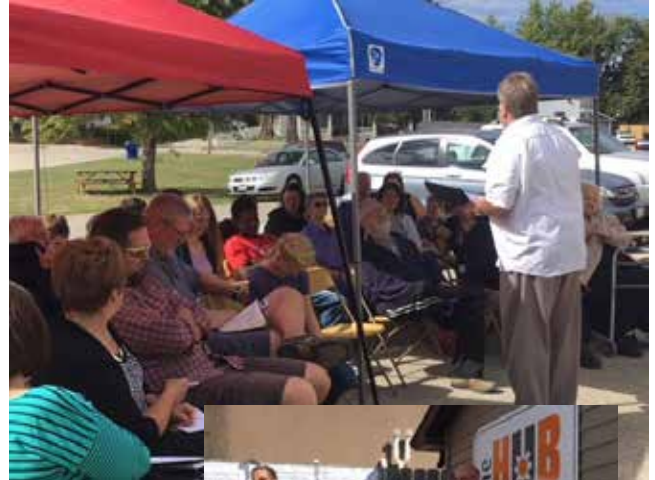
10.01.17 pictures from the first worship service at Living Stone Communities

October 1 was a milestone in that we held our 1st Sunday service! We worshipped in the parking lot outside The Hub with a couple of pop-up tents and words to songs written on post-it pads taped to the fence. Surprise, God came anyway! These services are the first and third Sundays through the end of this year, primarily for the core and committed people of our group. They will serve as a much needed ramp up time to get our feet wet and work out the logistics of a church service “on wheels” (not in a permanent location). We finalized plans regarding space at Irving School for Sundays. They blessed us